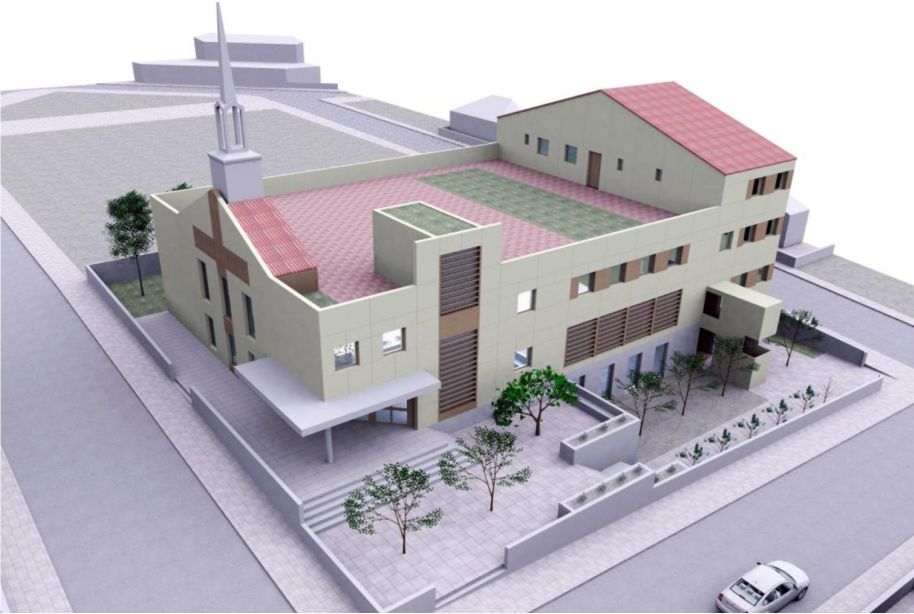
Exterior architect drawings (above) Exterior image basement entrance to dining hall and clothes bank (left) Exterior view of loading dock (right)