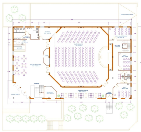
Main Sanctuary Level blueprints and 3d Image. Image includes offices and study area lobby